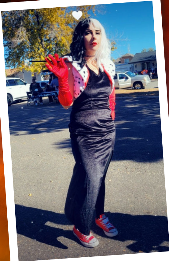
CRUELLA DE VILLE