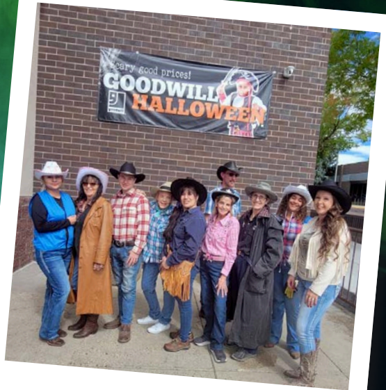
THE WILD WEST