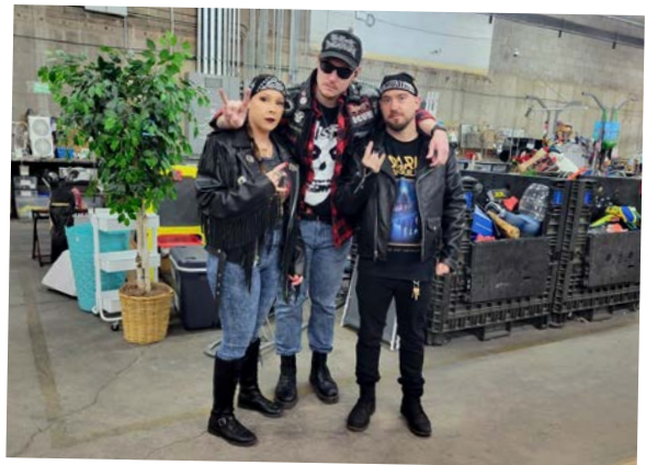
THE MISFIT GANG